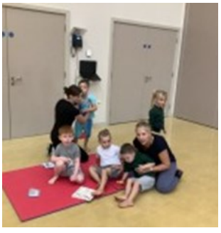
Our first P.E. lesson in the hall.