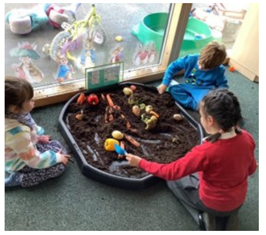
Acorns 4 enjoyed taking part in many different activities to celebrate Harvest.