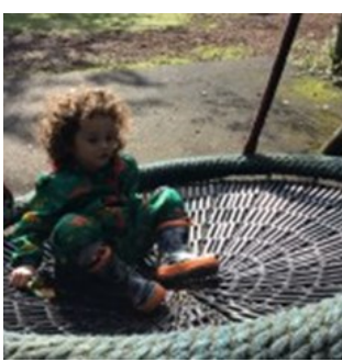
Enjoying a woodland swing.