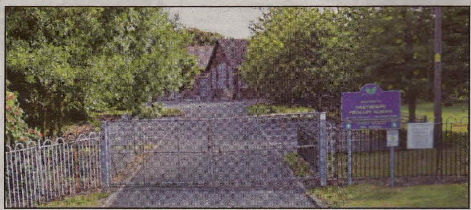
Oakthorpe Primary School

Cheques should be made payable to Coalville Times Ltd